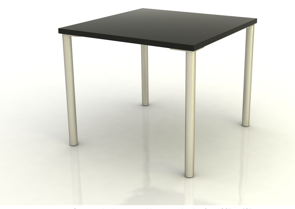
Our standard square tables range in size from 30" to 48" square. The unit above is shown with column legs, the others with a tubular X base and a disc base.